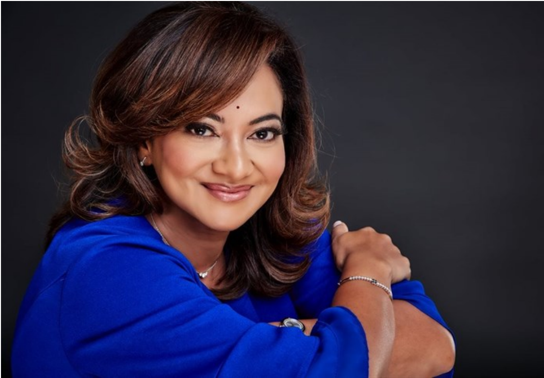
Every week South Africans watch Devi Sankaree Govender take on people twice her size - literally – on her television show Devi

From growing up in rural KwaZulu-Natal (KZN) to taking on people twice her size - literally - on her television show Devi , every week, investigative journalist Devi Sankaree Govender has a reputation for being fearless.