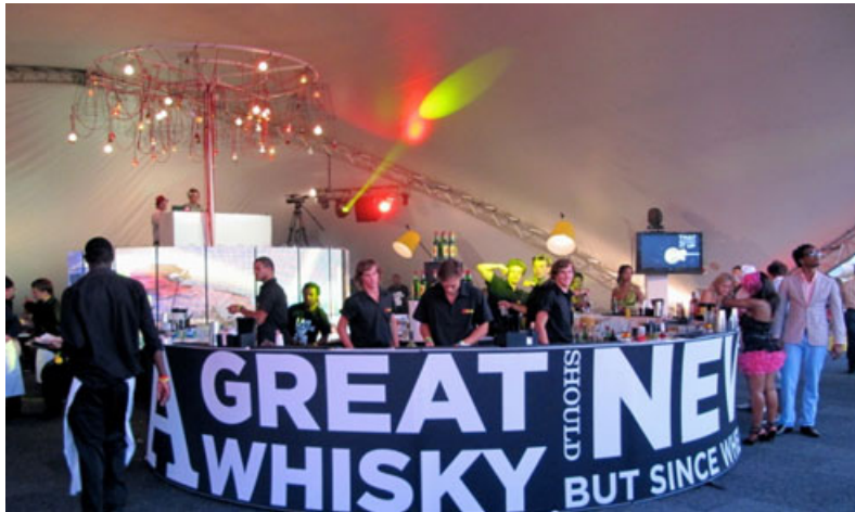
The new Thirst Saturn bar units launched at this year's J&B Met VIP marquee

Thirst Bar Services have soared to the top of South Africa's premium mobile bar market. The last 12 months has seen the company grow at a phenomenal rate, with Thirst being present at a huge majority of South Africa's premium events, offering a complete mobile bar solution which includes sushi, cocktails, premium coffee, smoothies and even mobile DJ's. Thirst's bar options have also grown but have kept in line with their "premium" status and services, their bar counters are not just the run of the mill Perspex bars on wheels, Thirst bars include, their experience bars, which are made from stainless steel and can be in black, white or even branded or wrapped. The new Saturn bar is state of the art, it's 5.5 meters in diameter, lightweight, can fit up to eight bartenders and has a cloth branding surrounding it which can be branded and kept for future events and its even machine washable.