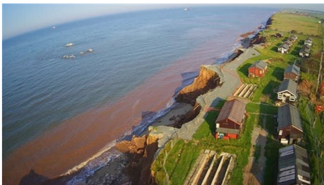
The clearly visible coastal erosion at Holderness endangers the communities who live there.

One way to do this is through visual storytelling. Storytelling, often involving drawings and paintings, has been used by human communities to pass on knowledge or tales of caution for at least 30,000 years - as you can see from the cave painting below.