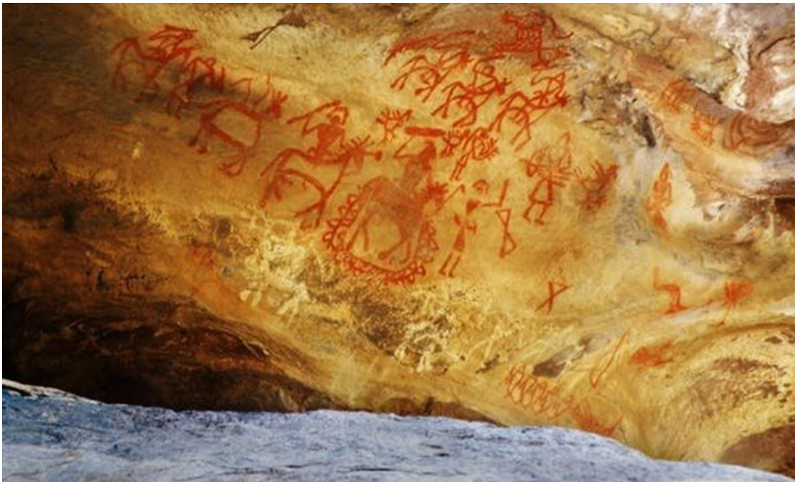
Paintings, in Bhimbetka Cave, central India, demonstrate humans' ancient impulse to tell stories.

Climate literacy is the ability to identify, understand and explain information associated with climate science. Being climate literate allows individuals to become active participants in the fight against climate change.