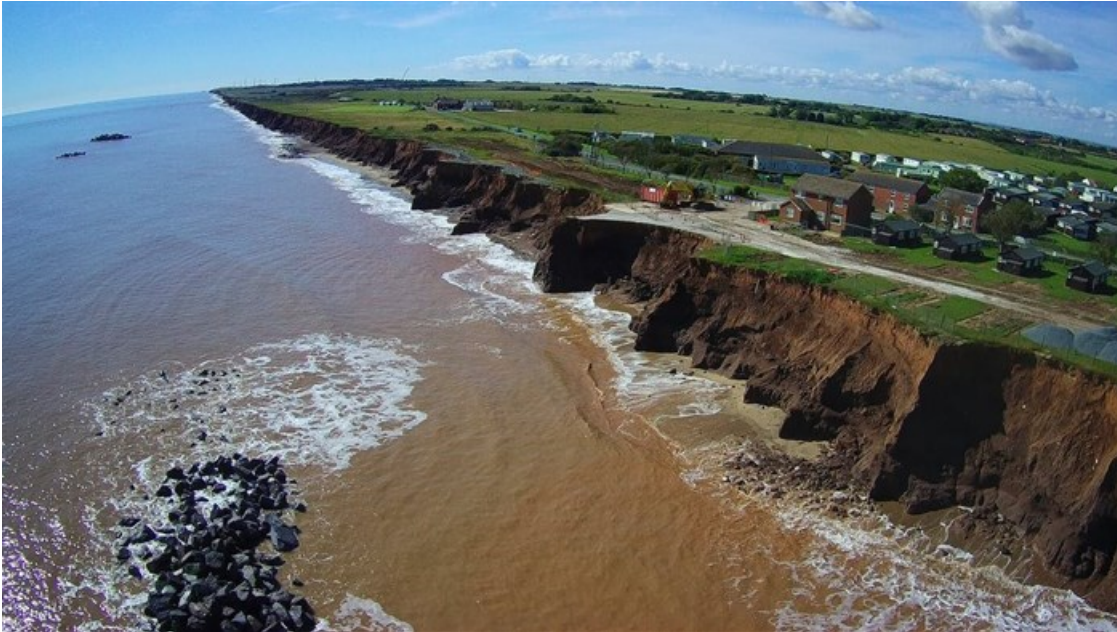
Coastal communities are likely to be hardest hit by climate change.

With the stark code red warnings from the world's climate experts in the most recent report by the Intergovernmental Panel on Climate Change (IPCC) still ringing in our ears, it's vital to give as many people as possible the tools with which to tackle the climate crisis. And key to this is encouraging climate literacy.